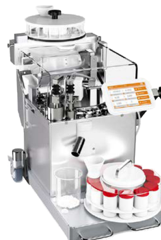
UTS 4.3 With feeder and collector