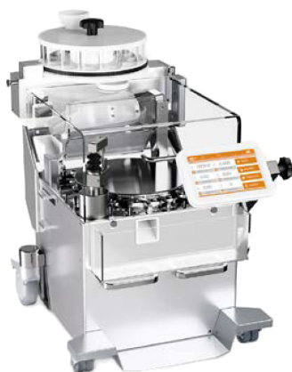
UTS 4.3 With feeder