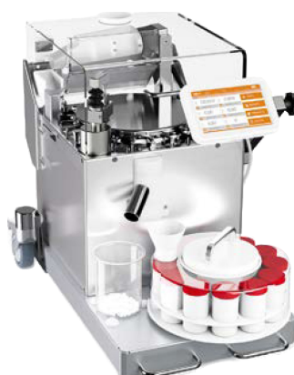
UTS 4.3 With collector